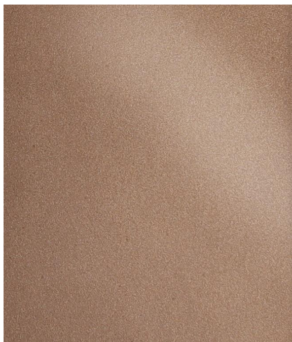
Acciaio verniciato Rame Copper painted steel