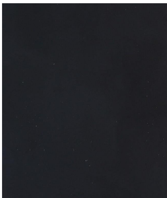
Acciaio verniciato Nero Black painted steel